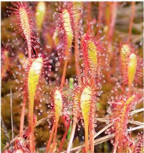
Figure 2: Drosera anglica from a Kenai Peninsula bog during the summer of 2012.